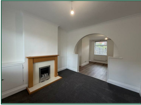
GROUND FLOOR 446 sq. ft. (41.4 sq.m.) approx.